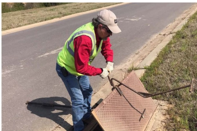
LA 2019 Winner: Ouachita's Catch Basin Lid Assist Tool

The tool only cost the agency less than $100, including labor and materials. Crew members can use it to lift and lower catch basin lids for inspection. They no longer need to use brute force to lift and lower catch basin lids, thereby increasing overall worker safety and decreasing the incidences of finger- and toe-pinch injuries.