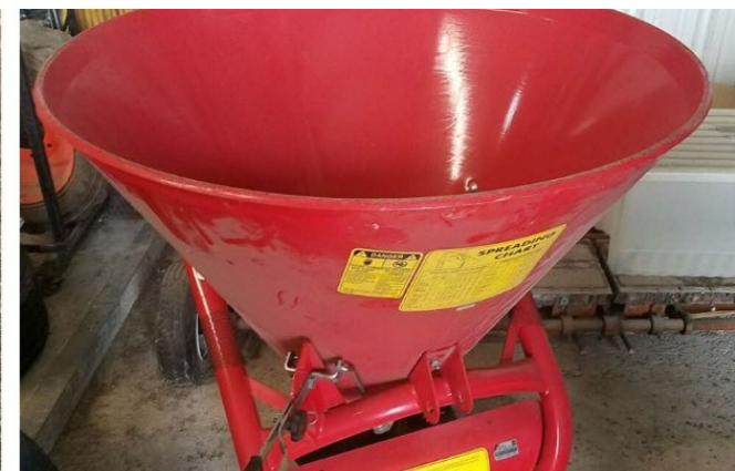
LA 2019 People's Choice: Terrebonne's In-a-Pinch Salt Spreader

See pages 19-20 of the 2019 BABM Booklet: https://www.fhwa.dot.gov/clas/pdfs/2019_mousetrap_entries_booklet.pdf