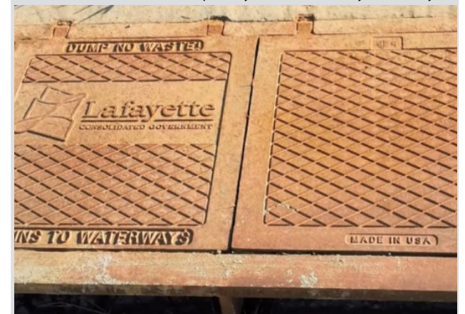
An inlet drain top, Lafayette's BABM entry from last year