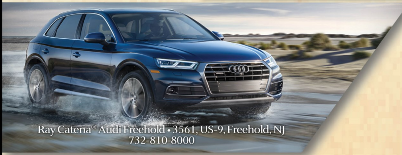
Ray Catena® Audi Freehold • 3561, US-9, Freehold, NJ 732-810-8000