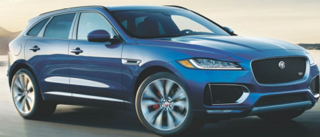
Jaguar Marlboro • 480 US-9, Marlboro, NJ 732-810-4000