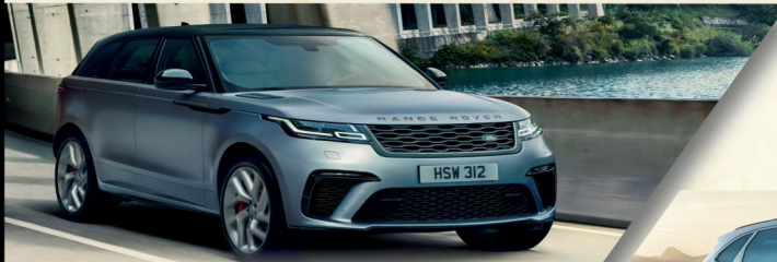
Land Rover Marlboro • 480 US-9, Marlboro, NJ 732-810-4000

The Ray Catena® Family of Dealerships extend their gratitude and appreciation to all members for your patronage over the many years.