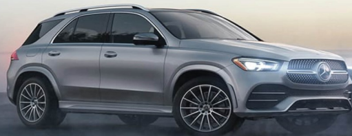
Ray Catena® of Freehold • 4380 US-9, Freehold, NJ 732-339-6800