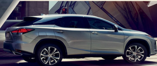
Ray Catena® Lexus of Freehold • 4264 US-9, Freehold, NJ 732-410-2900