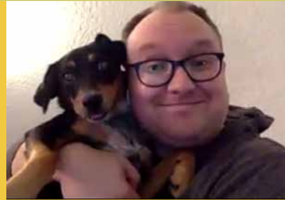
Pet Parade party