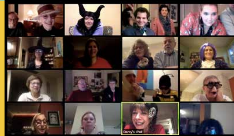
Halloween Trivia Night