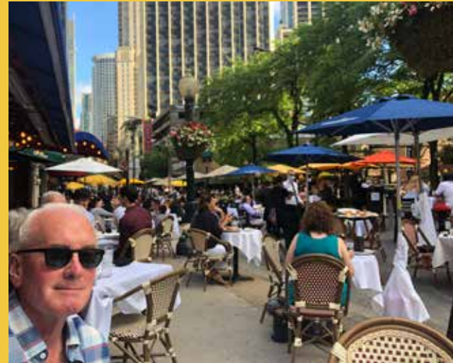
Summer outdoor dining