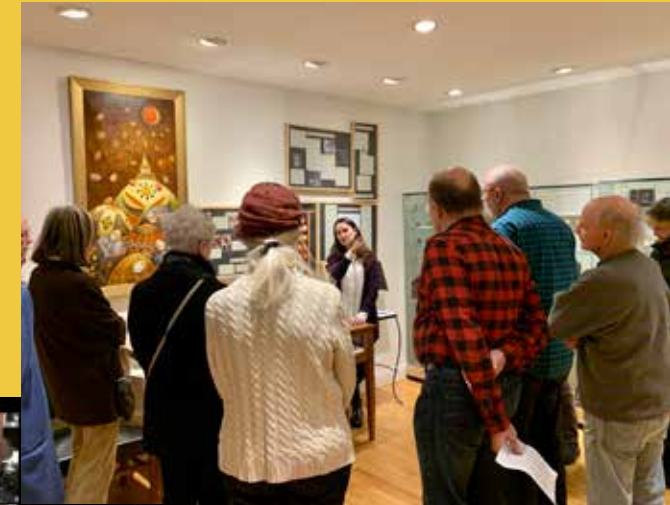
Ukrainian Village tour