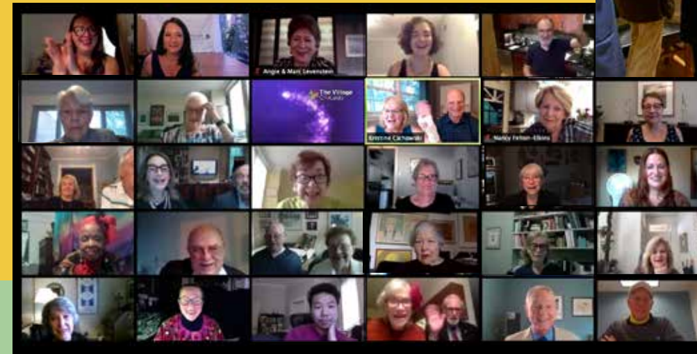
Annual Benefit via Zoom