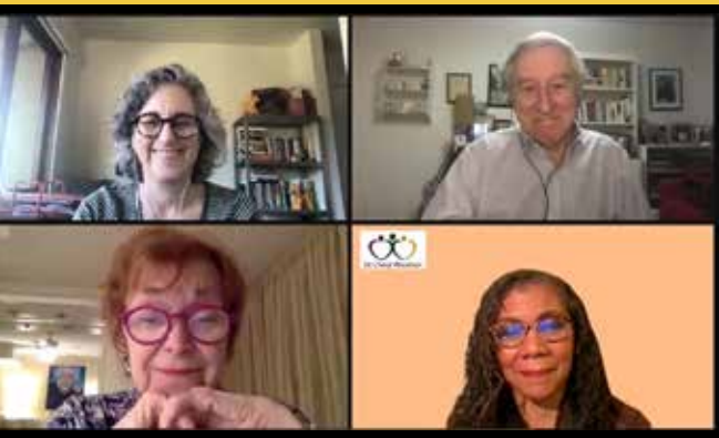
Thought Leaders event with the Trailblazers

is a key component of health, longevity, and happiness. In 2020, we hosted more than 300 Zoom events and gatherings that were experienced by 85% of Village members and hundreds of guests. New programs included Front Porch, Current Events, Coffee Chat, and Racial Divide discussion groups plus many more. Our Annual Benefit was capped by awarding the annual Village Chicago Trailblazer Awards for outstanding work on changing the narrative about life after 50.