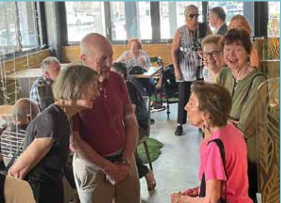
Village Happy Hour