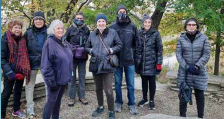
Walk in the park