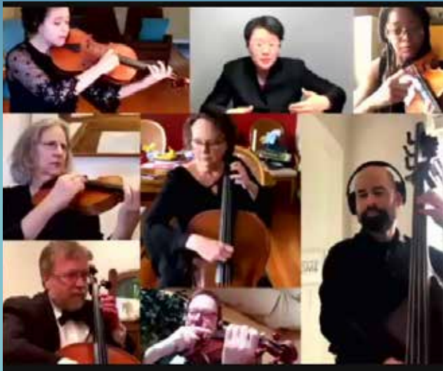
The Chicago Sinfonietta