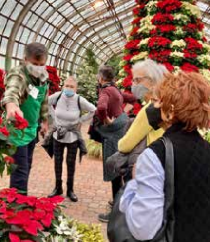
Tour of Lincoln Park Conservatory