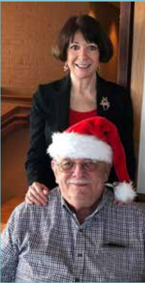
Annual Holiday Luncheon