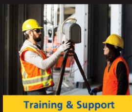
Training & Support