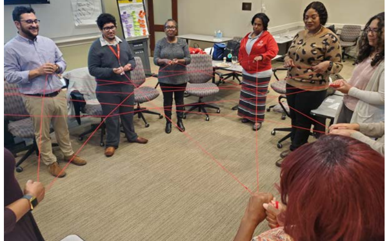
Photo from November 18th, 2019 at a CCYWI Training

to programming, and navigating uncertainty in resources that were typically allocated to support their programs. During the fall of 2021, as these programs continue to adapt, the CCYWI is excited to continue providing training and technical assistance to support youth, youth professionals, and youth programs. With the addition of funding from SAMHSA, the Institute will be able to expand programming to better equip youth professionals and OST programs to address the mental health needs of youth and families within the community.