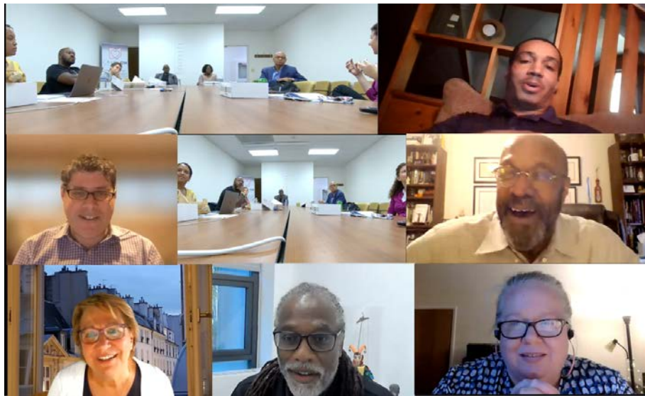
Screenshot from the Community Advisory Working Group Meeting on October 4th, 2021

At the heart of this project is the co-development of activities by community stakeholders, institutional partners, and investigators to ensure CAAPP is rooted in the community's experience, needs, and preferences. In partnership with our Community Advisory Working Group, we have begun our early phase project activities, including discussing ideas for delivering prostate cancer education to men and their families and community engagement events that would motivate men for screening.