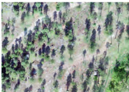
A dry interior Douglas fir stand pre- (left) and post- (right) fuel treatment.