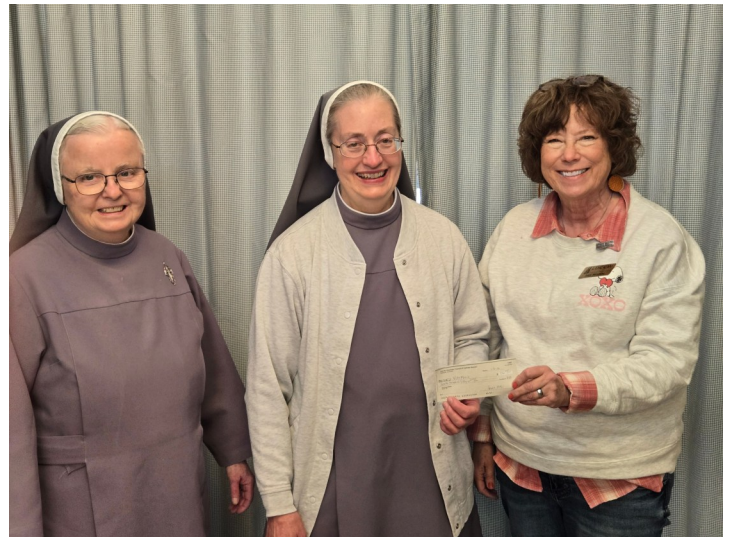
Presentation of check to Villa Marie