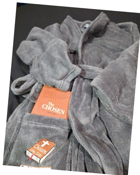
Garden Statue 3' Tall