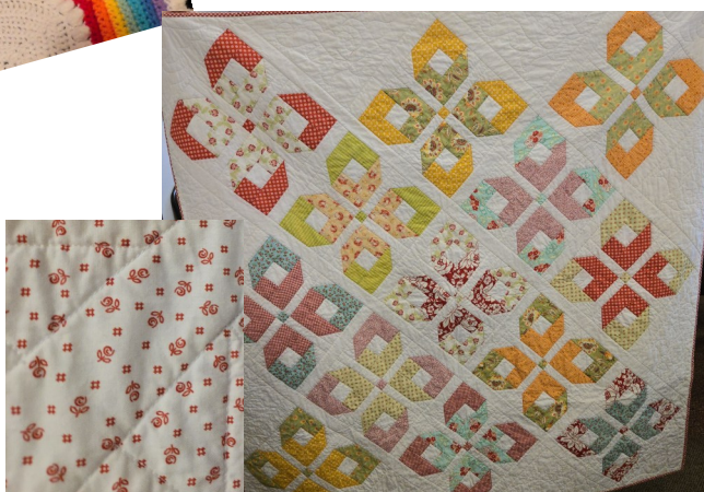
Butterfly Blossoms Lap Quilt 64" square