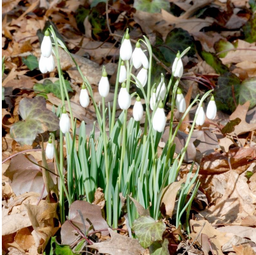
snow drops at Lee Garden 2017