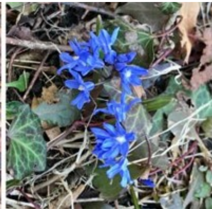
Crocus, Iris cristata , and squill have been blooming at Lee Garden.