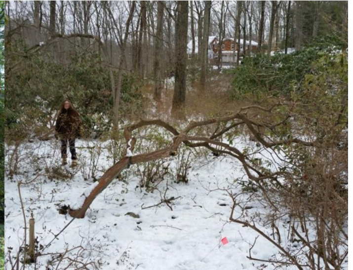
Yvonne Hunkeler looks at the fallen Rhododendron after the storm.