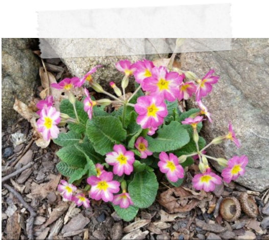
A primrose grows at Lee Garden.

They can be dropped off at the parking lot of the garden, under our kiosk there, or dropped to my porch, 47 Kelley Green, anytime. We will plant them at Lee for next year's bloom.