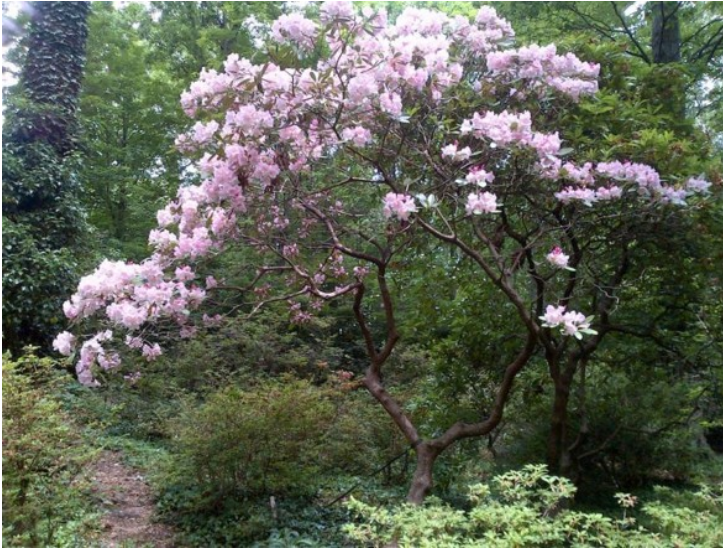
This rhododendron was too beautiful not to save. Photo from a previous spring.

A large stately Rhododendron fortunei 'Lu Shan' along the main path fell over with roots still intact. Too beautiful to let it go, Rob Carpenter, Yvonne Hunkeler, and Faith Kerchoff use rope pulleys to lift it back into position. They tied it in place, and added soil and hollytone around its base.