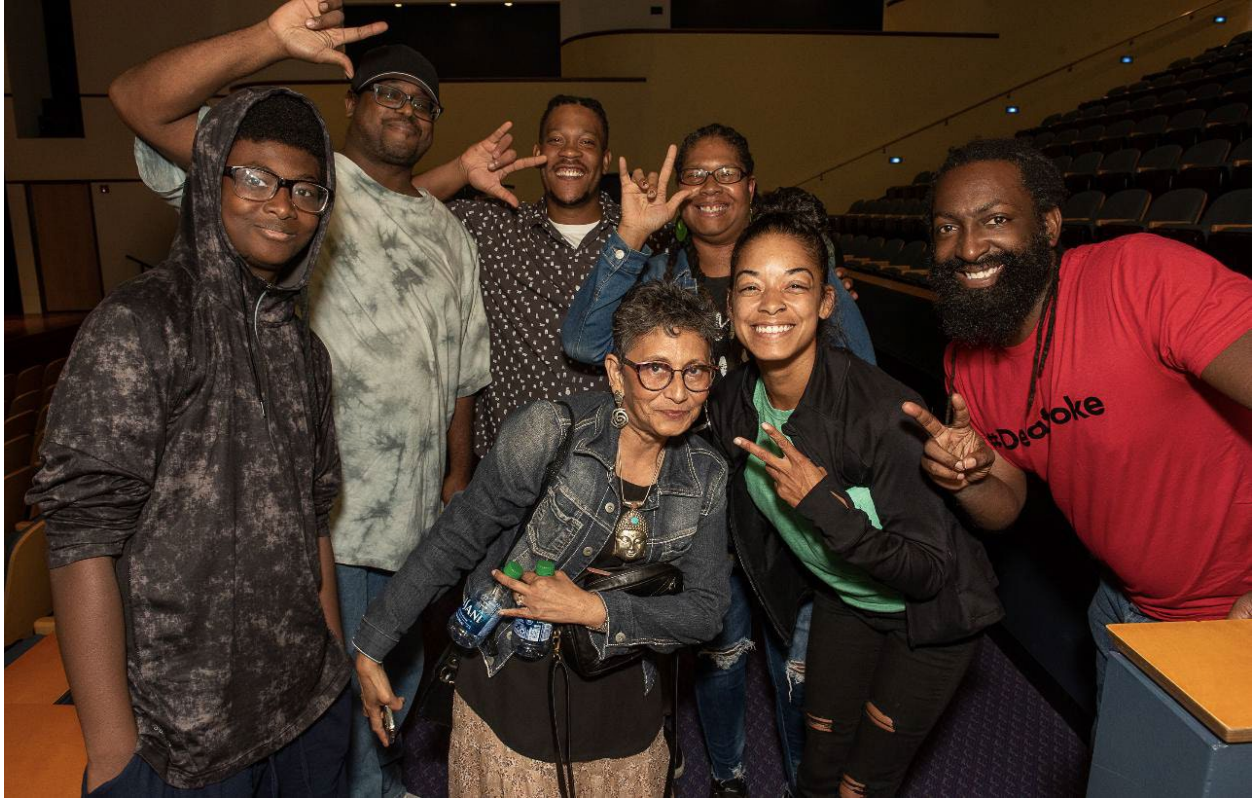
San Francisco Deaf Club made it possible for many to join the Oakland International Film Festival to watch the Sign the Show.