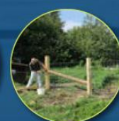
Restricting Livestock from Waterbodies