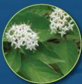
Planting native trees and shrubs