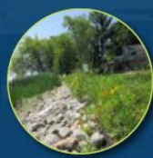
Shoreline Erosion Control