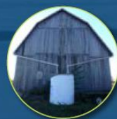
Diverting clean runoff

For more information and to apply: http://kawarthaconservation.com/incentivegrants 705.328.2271 ext.240.