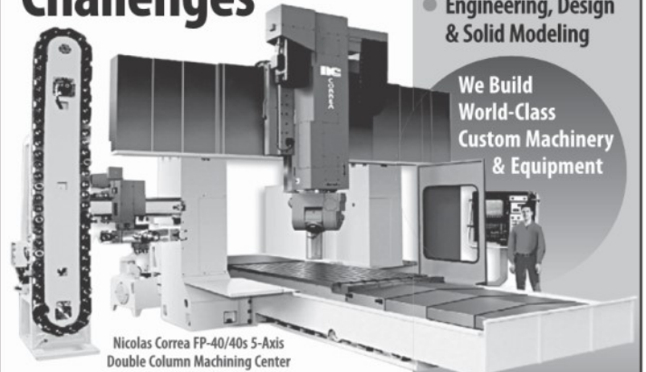
Nicolas Correa FP-40/40s 5-Axis Double Column Machining Center

We Build World-Class Custom Machinery & Equipment