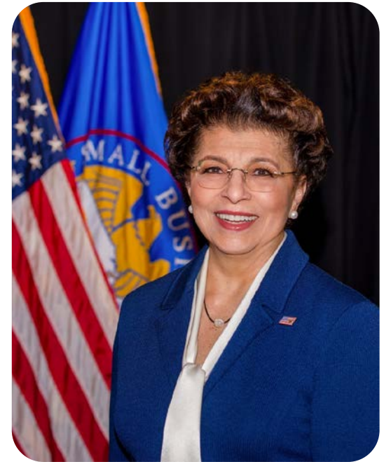
Administrator Jovita Carranza

Upon a request received from a state's or territory's Governor, SBA will issue under its own authority, as provide by the Coronavirus Preparedness and Response Supplement Appropriations Act that was recently signed by the President, an Economic Injury Disaster Loan declaration.