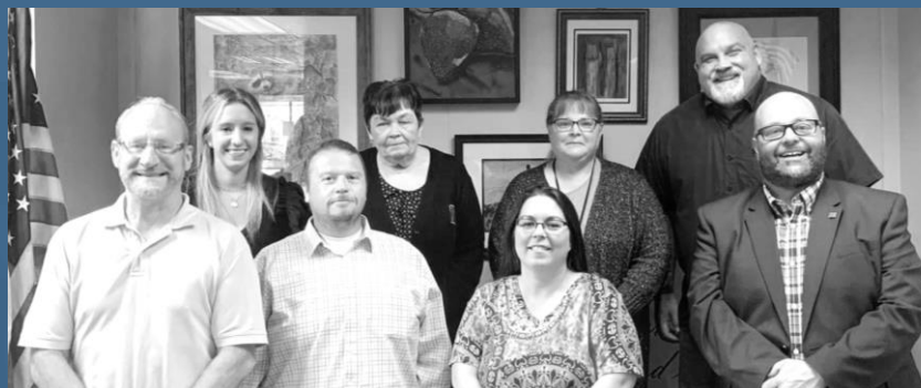
2022 West Virginia Cohort