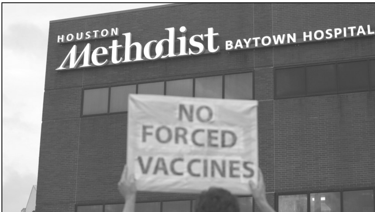
People bring signs to protest Houston Methodist Hospital system's rule of firing any employee who is not immunized by Monday, June 7, 2021, at Houston Methodist Baytown Hospital in Baytown, Texas. Houston Methodist staff who have refused the COVID-19 vaccine so far and their supporters participated in a gathering and march.