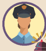
1. Service (includes firefighters and police)