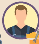
4. Installation, maintenance and repair