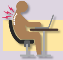
Soreness or pain