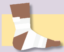
Sprains, strains or tears

Most common types of injuries keeping workers away from work