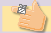
Cuts, lacerations or punctures