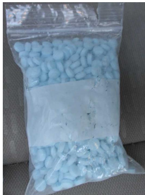
Photo provided for informational purposes, not actual tablets seized.

Counterfeit “M-30” Oxycodone pills containing Fentanyl