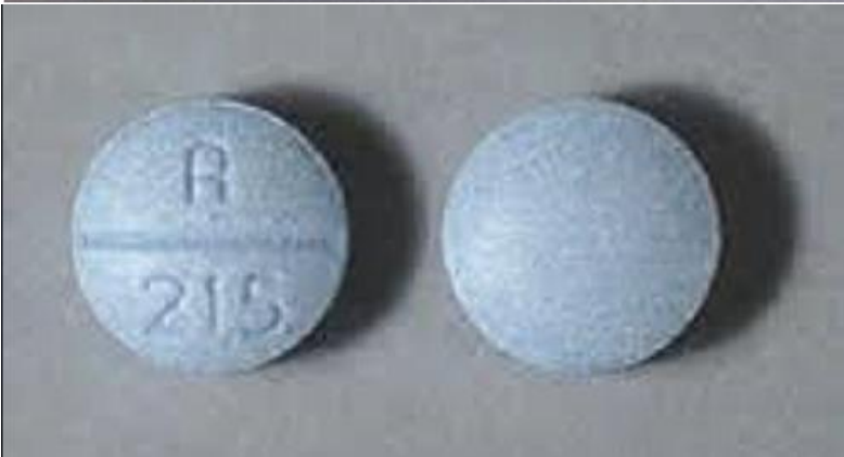
Photos provided for informational purposes, not actual tablets seized.