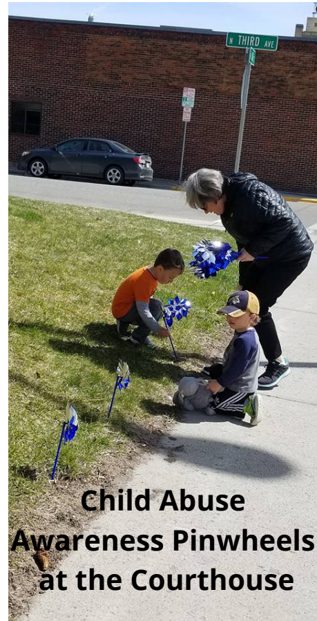
Child Abuse Awareness Pinwheels at the Courthouse

Since coming on as the Executive Director for CASA/GAL meant she would be filling some large shoes, she set right to work. She was a staff of one and had plenty of work to do. This was her first time working for a nonprofit so she cast a wide net and learned through trial and error what would work and what wasn't working, especially as it pertained to fundraising. She was grateful to the other program Executive Directors who were there for her. They would lend their expertise when asked and helped her overcome obstacles to be even more successful.