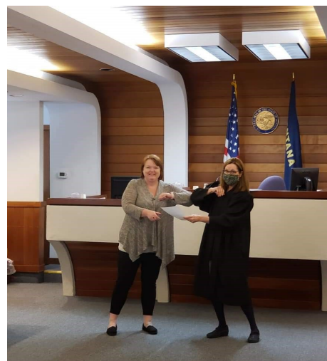
SWEARING IN CEREMONY