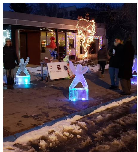
Christmas Stroll Downtown Bozeman