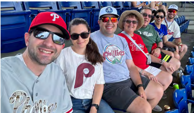
Raspa Family Scholars Program Donors

"Our time at GC helped us to form a strong foundational knowledge as well as develop relationships to excel in the classroom and succeed in our career endeavors," they said. "We both discovered a passion for helping others at GC, which ultimately led us to pursue careers in health care."