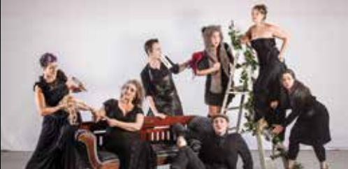
MAPA LIVE!: INTO THE WOODS