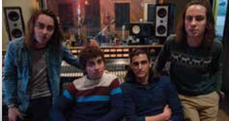
GRETA VAN FLEET