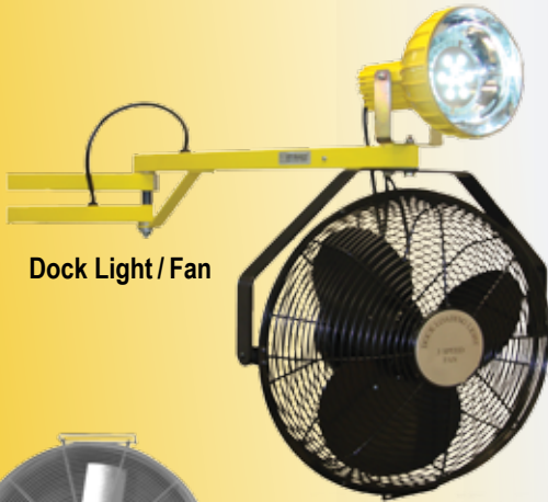
Dock Light / Fan