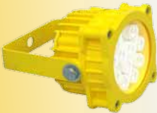
High Impact LED Dock Light