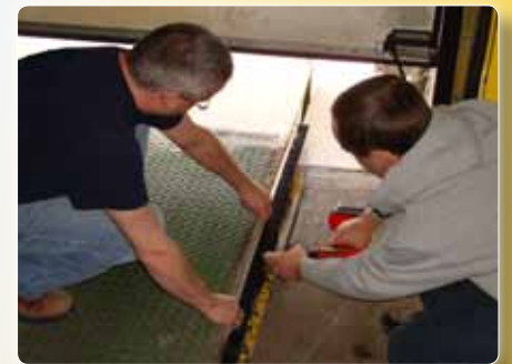
Dock Leveler Brush Seal