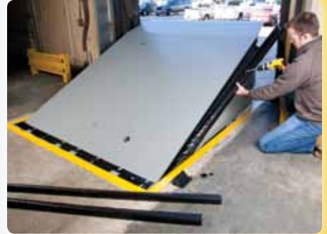
ENERGY GUARD Retrofit Kit Installation