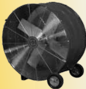
Portable Air Blower