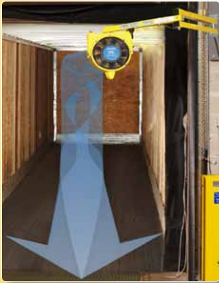
HV-ES Energy Saving Fan