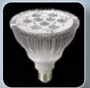
E-Saver LED Lamp