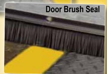
Door Brush Seal