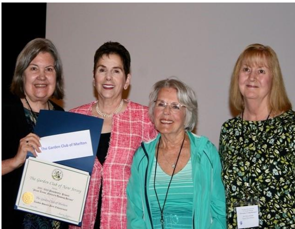
President's Project Grant winner and $1000 recipient of the Garden Club of Marlton