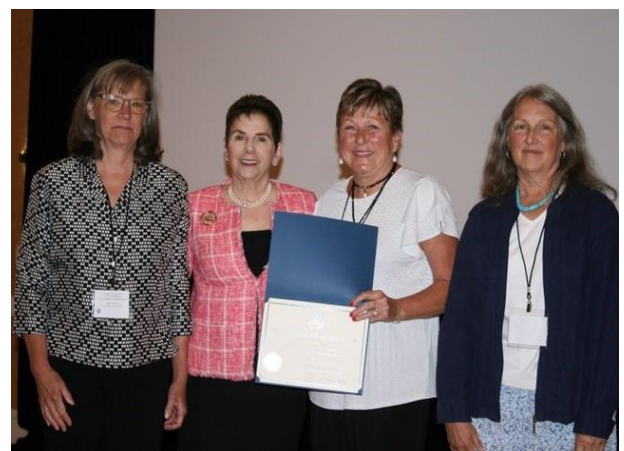
President's Project Grant winner and $1000 recipient of the Maplewood Garden Club