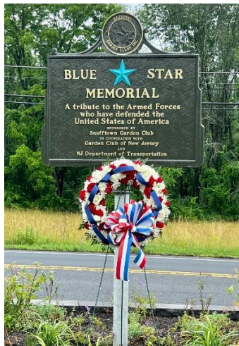
Snufftown Garden Club's newly dedicated Blue Star Memorial Marker in Sparta.