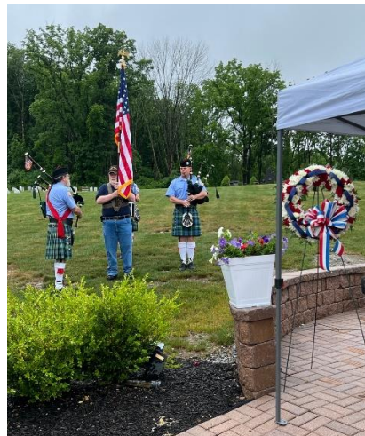
Presentation of Colors by the Vietnam Veterans of America Chapter 1002