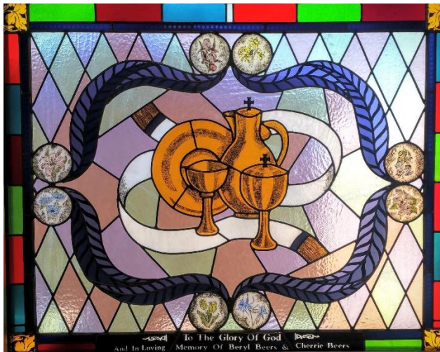
Stained glass window in the Sacristy at St. Luke's.

Our Mission: To know Christ and to make Christ known.