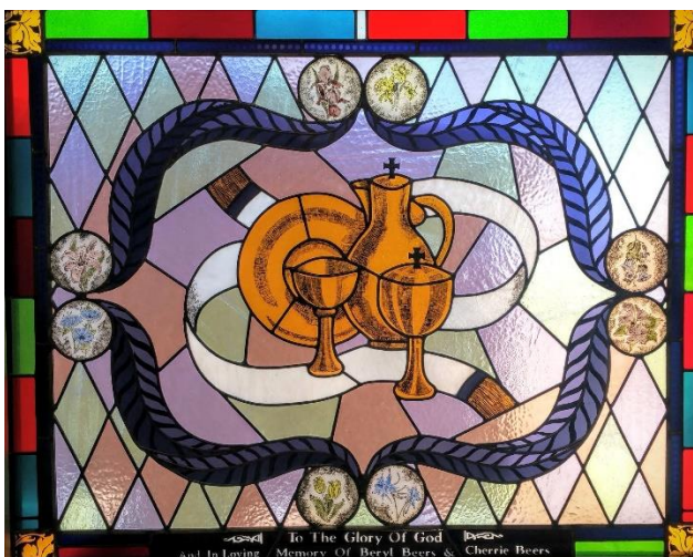
Stained glass window in the Sacristy at St. Luke's.

Our Mission: To know Christ and to make Christ known.