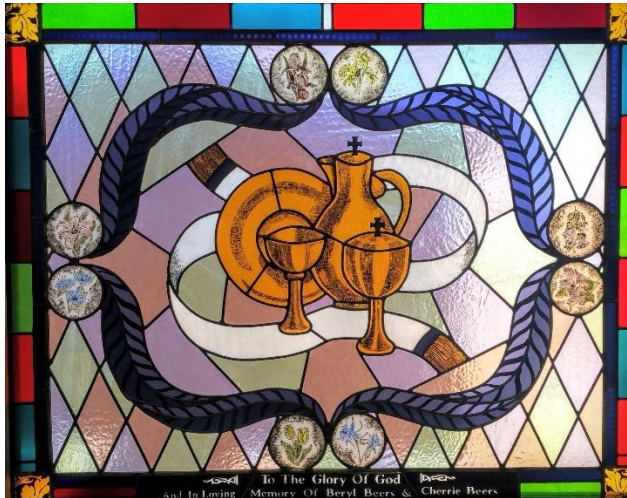
Stained glass window in the Sacristy at St. Luke's.

Our Mission: To know Christ and to make Christ known.