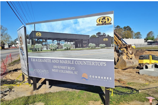
E&A Granite and Marble Countertops

said. “Our expert team provides precision fabrication, ensuring each countertop is crafted to perfection. We also offer a wide variety of unique edging options, adding a personalized touch to your kitchen or bathroom. Throughout the entire process, we deliver top-notch craftsmanship and seamless installation for every project.