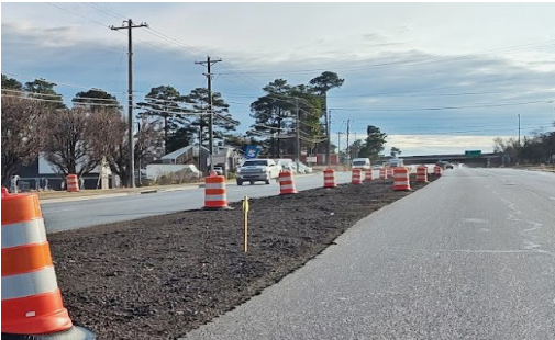
US-1/Augusta Road Corridor Safety Project