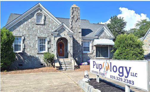
Pupology opens in West Columbia.

Pupology Grooming Studio is now open at 1730 Augusta Road in West Columbia. Dana Copland is the owner, and she wants your dog to look good and feel good.