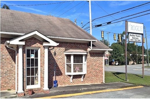
The Rogue on Sunset Boulevard.