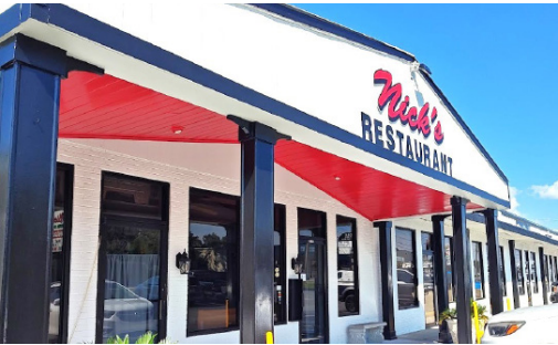
Nick’s new facade on Sunset Boulevard.