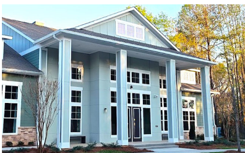
Langley Pointe Apartments are now leasing.

The Langley Pointe Apartments are open and now leasing. Langley Pointe is a $60 million high-end apartment complex, with 1, 2, and 3-bedroom units at the intersection of Henbet Drive and Sunset Boulevard in West Columbia.