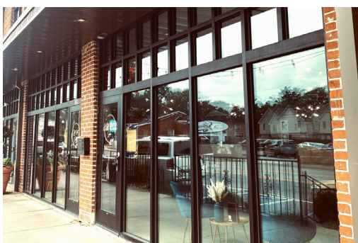
State Street Salon at 128 State Street.