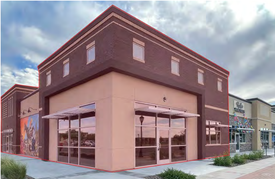
BUILDING F - 1,200 SF - 3,316 SF End Cap Available (at signalized intersection)