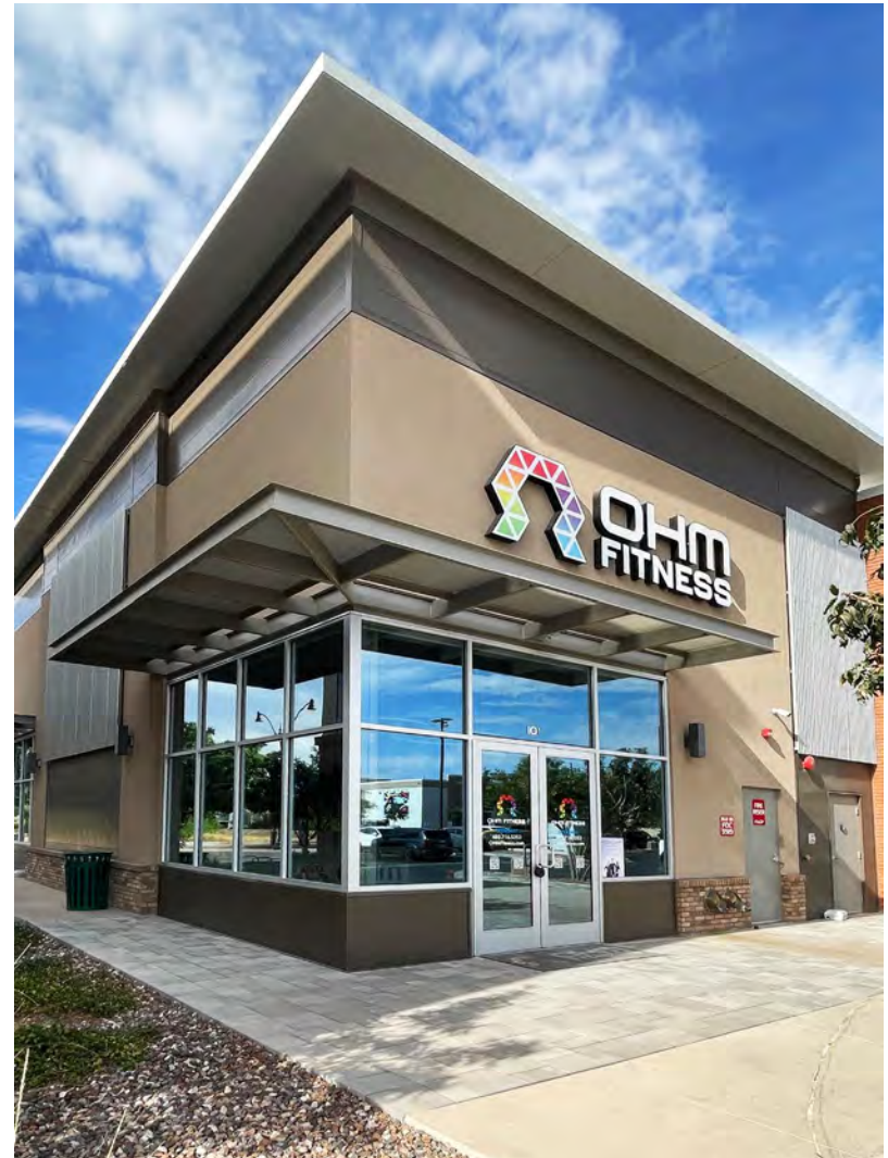
BUILDING B - 1,888 SF End Cap Available (former OHM Fitness)