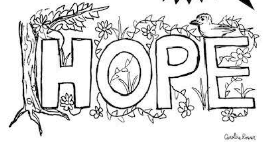
HASTINGS ON HUDSON YOUTH COUNCIL 2021