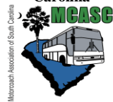
Motorcoach Association of South Carolina