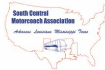
South Central Motorcoach Association