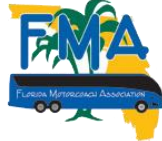
Florida Motorcoach Association