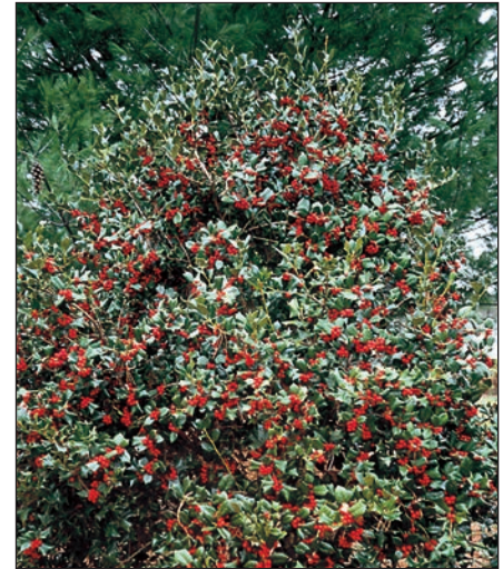
A bird garden might include trumpet honeysuckle ( Lonicera sempervirens ) [below left]; its tubular shaped flowers attract hummingbirds. Arrowwood viburnum ( Viburnum dentatum ) [above] and American holly ( Ilex americana ) [above right] provide berries and cover.