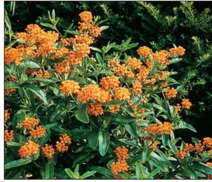
Black-eyed Susans ( Rudbeckia hirta ) [left] and butterfly-weed ( Asclepias tuberosa ) [right] are good nectar sources for butterflies and can tolerate dry conditions.

T here's an effort underway today by conservation-minded individuals to fill in the habitat gaps that exist in and around our highly paved and populated towns and cities. Although we can not turn back and un-build or un-populate suburbia, we can make an effort to restore—if only on a very small scale—some of the habitat features that are being usurped by the construction boom. The natural landscaping movement that is now sweeping the country illustrates a recognition that each of us can be part of a solution.