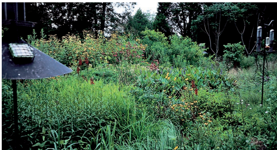
Moisture-loving plants hide the water feature nestled within this well-constructed, miniature “wetland.” The plant material, water, and nearby feeders create a habitat haven for birds, amphibians and other wildlife.

plants at the store are “Japanese this” or “Oriental that”). Whereas the use of native plants contributes to the species diversity of an area, exotic invasive plants are often associated with loss of productive habitat. This is because many exotic species can out-compete native ones and may take over an area. The “take-over” might not be readily apparent in your own neighborhood, but it is quite visible when you inspect the plant material that grows in one of your county’s woodlands or along a local stream. Japanese honeysuckle, English ivy, privet and autumn olive are a few of the most tenacious.