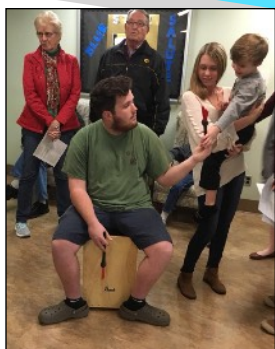
Youth Caroling at Georgia War Veterans Nursing Home