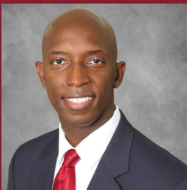
Mayor Wayne M. Messam

2300 Civic Center Place | Miramar, FL 33025