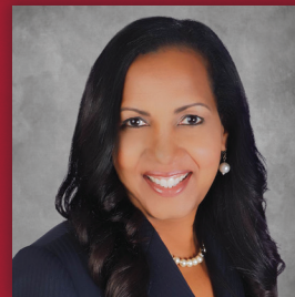
Commissioner Yvette Colbourne