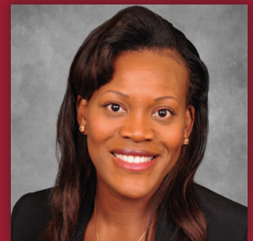
Commissioner Darline B. Riggs