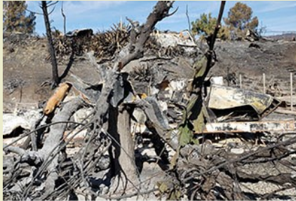
Seminole Springs Mobile Home Park in Cornell, California

We know that your hearts, like ours, have been broken as the devastation wrought by wildfires in California continues to increase in severity. In addition to the destruction of land and forests, the cost to lives and human community has been unprecedented, and those costs are still rising. The town of