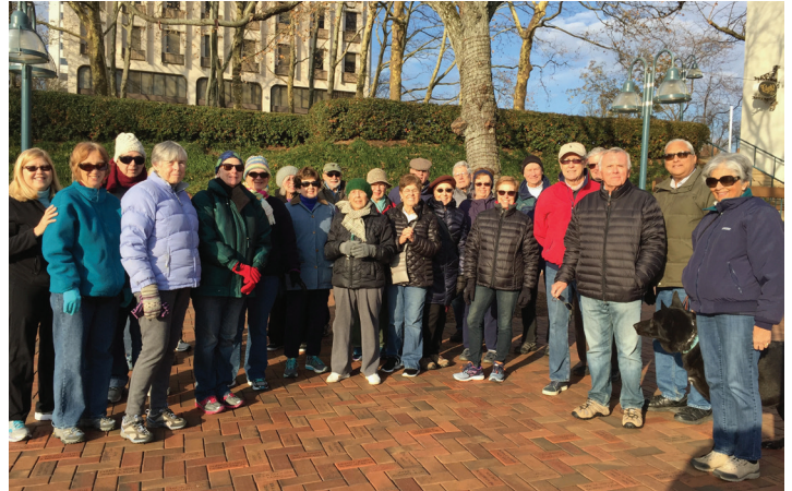
Sneakers and coffee.

Join us in May at Bare Bones Grill & Brewery, 9150-22 Baltimore Natl. Pike, Ellicott City, MD 21042, known for its lively brew and hearty American fare.