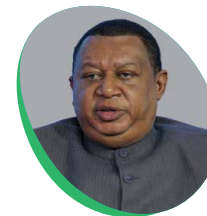
Mohammed Barkindo Secretary General of the Organization of the Petroleum Exporting Countries

✓ "Our countries' partnership in cooperation with a coalition of 24 states has become a catalyst for important long-term decisions and has breathed new life into OPEC."