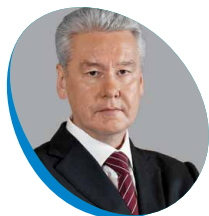
Sergei Sobyenin Mayor of Moscow

➤ "The substantive dialogue emerging from Russian Energy Week will enable us to come up with unified approaches to the development of the international energy agenda, and to launch new, mutually beneficial initiatives."