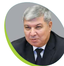
Gulomzhon Ibragimov Deputy Prime Minister of the Republic of Uzbekistan

✓ "This is the first time that Russia has hosted such a large-scale international platform as Russian Energy Week, an umbrella under which all of the most significant industry events have been brought together. I am convinced that Russian Energy Week will enable us not only to chart the paths for further development of the energy sector as a whole, but also to demonstrate our achievements."