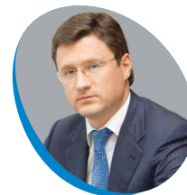
Alexander Novak Minister of Energy of the Russian Federation

✓ "It is a great honour for me to be here, as a representative for renewable energy sources, sharing the stage with the world's leading producer of energy and hydrocarbons. Together with representatives from major organizations. Such a thing would have been hard to imagine only a few years ago."