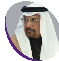
Khalid A. Al-Falih Minister of Energy, Industry and Mineral Resources of the Kingdom of Saudi Arabia

✓ "We are ready within the context of Russian Energy Week to examine and discuss all proposals from interested parties and to engage in cooperation on a mutually beneficial basis."