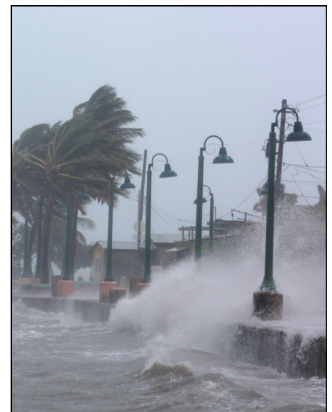
Irma in the Caribbean 9/6/17

Congregational Life, UUA Southern Region