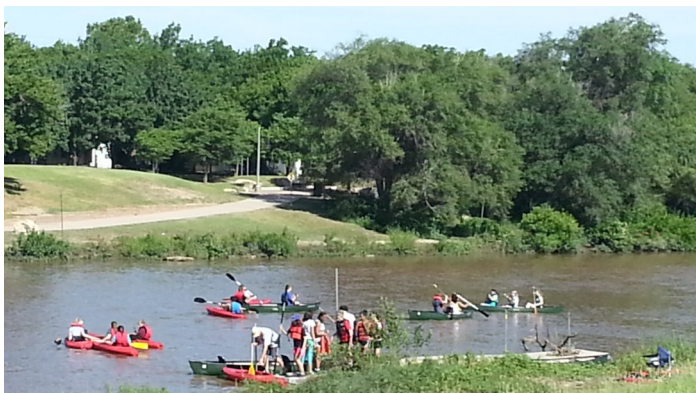
Kayaking and canoeing at North High this summer