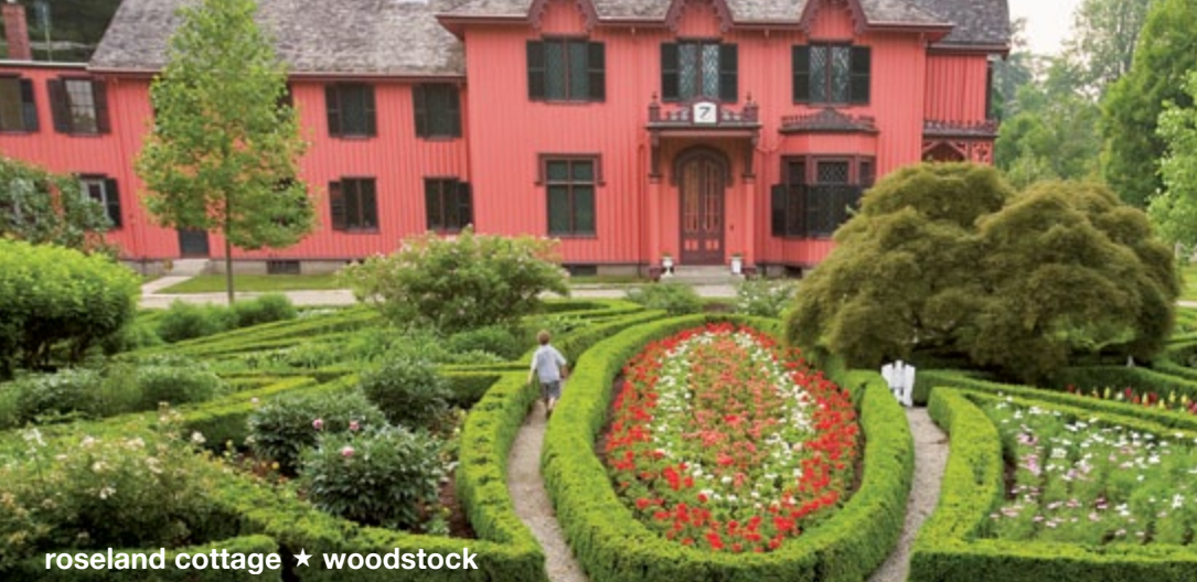
roseland cottage ★ woodstock