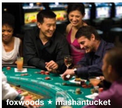
foxwoods ★ mashantucket