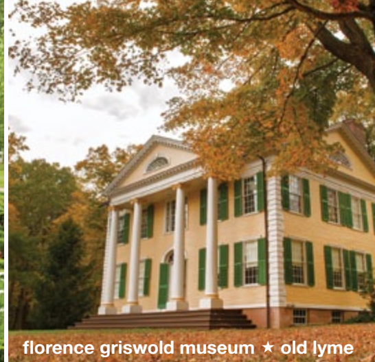
florence griswold museum ★ old lyme