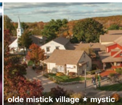
olde mistick village ★ mystic