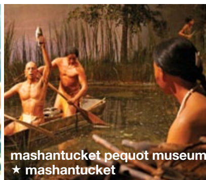
mashantucket pequot museum ★ mashantucket