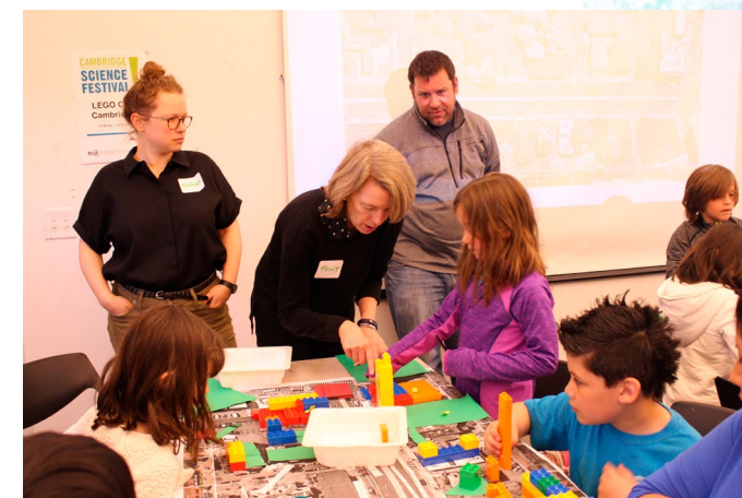
Students used LEGO bricks to design the future of Cambridge as part of a Cambridge Science Festival workshop hosted by MMA

However, when a student wants to take a class, there can