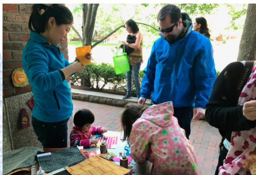
Making art with MMA at the Cambridge Arts River Festival