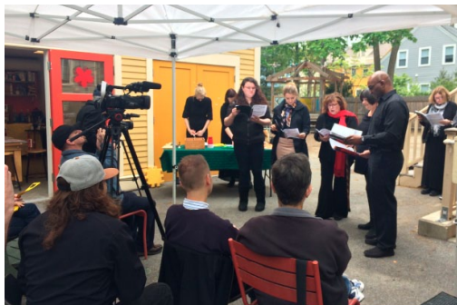
MMA drew visitors from throughout the region during Cambridge Open Studios