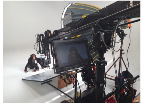
Super Technocrane and Brieze light provided Moving Picture Rental

The Chief Productions' Lottoland job was unique -- they filmed a chimpanzee (of Wolf of Wall Street fame) evolving from a chimp into a Neanderthal through to modern man, mimicking Lottoland's lottery evolution. To achieve the look they rented an Alexa Mini, Cooke S4/i lenses and lighting from Moving Picture Rental.