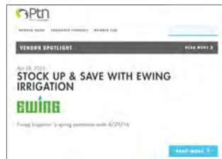
Special Recognition on the PTN website