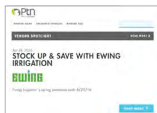
Special Recognition on the PTN website