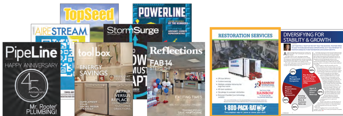
Full Page Ad