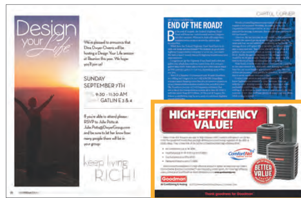
Half Page Ad