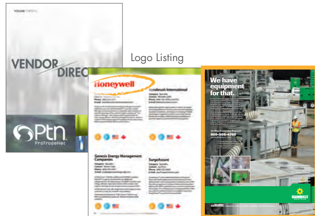
Full Page Ad