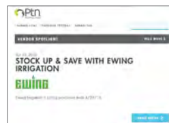
Special Recognition on the PTN website