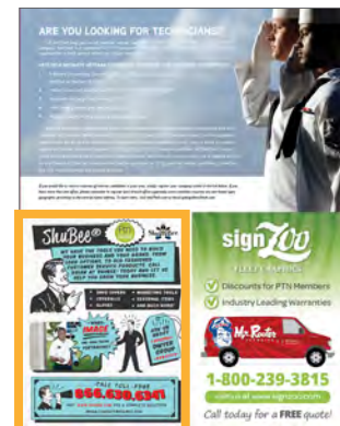
Quarter Page Ad