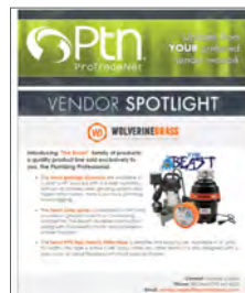
Vendor Spotlight in ProTradeNet Newsletter