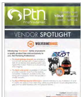
Vendor Spotlight in ProTradeNet Newsletter