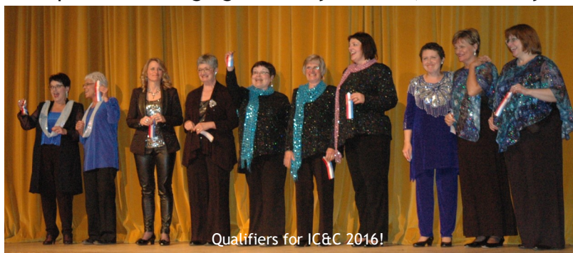
Qualifiers for IC&C 2016!

except for the singing—that my friends, I leave to you!)