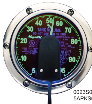
0023S00031 Module Cover on 5APKS03045 Fluorescent Dial