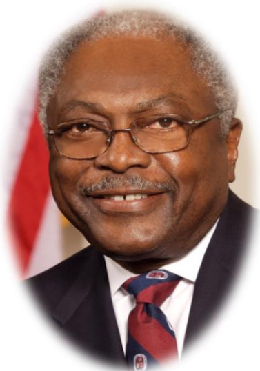
Honorable James Clyburn Member U.S. House of Representatives @Clyburn

Brendan Carr was nominated to serve as a Commissioner of the FCC by President Donald J. Trump and was confirmed unanimously by the United States Senate on August 3, 2017. He was sworn into office on August 11, 2017. Commissioner Carr brings to the position over a dozen years of public and private sector experience in technology and communications law and policy. Most recently, Commissioner Carr served as the General Counsel of the FCC. In that role, he served as the chief legal advisor to the Commission and FCC staff on all matters within the agency's jurisdiction. Previously, he served as the lead advisor to FCC Commissioner Ajit Pai on wireless, public safety, and international issues. Before that, he worked as an attorney in the FCC's Office of General Counsel, where he provided legal advice on a wide range of spectrum policy, competition, and public safety matters.