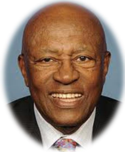
Honorable Edolphus Towns