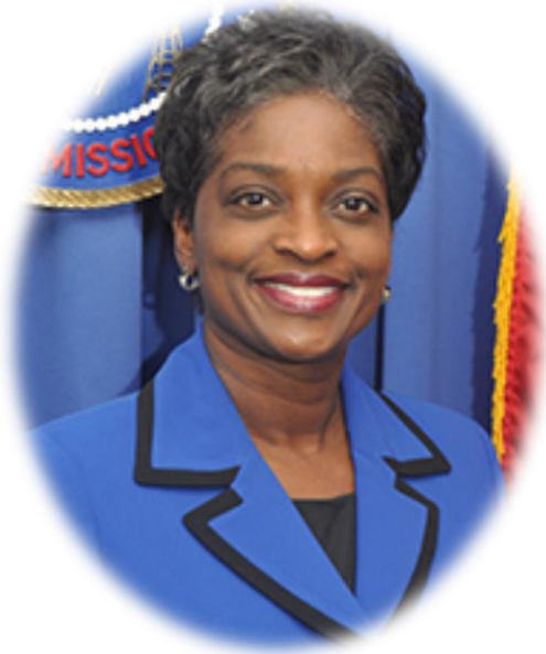
Honorable Mignon Clyburn Former Acting Chairwoman and Commissioner, Federal Communications Commission @MignonClyburn @FCC #FCC

Mignon Clyburn was sworn in for her first term as commissioner on August 3, 2009; sworn in for a second term on February 19, 2013; and served until June 6, 2018. She also served as Acting FCC Chairwoman from May 20, 2013 through November 4, 2013. While at the FCC, Commissioner Clyburn was committed to closing the digital divide. Specifically, she was an advocate for Lifeline Modernization, which assists low income consumers defray the cost of broadband service, championed diversity in media ownership, initiated Inmate Calling Services reforms, emphasized diversity and inclusion in STEM opportunities, and fought to preserve a free and open internet. Prior to the FCC, she spent 11 years as a member of the sixth district on the Public Service Commission (PSC) of South Carolina. Prior to the PSC, Clyburn was the publisher and general manager of her family-founded newspaper for 14 years, the Coastal Times, a Charleston-based weekly newspaper that focused primarily on issues affecting the African American community.