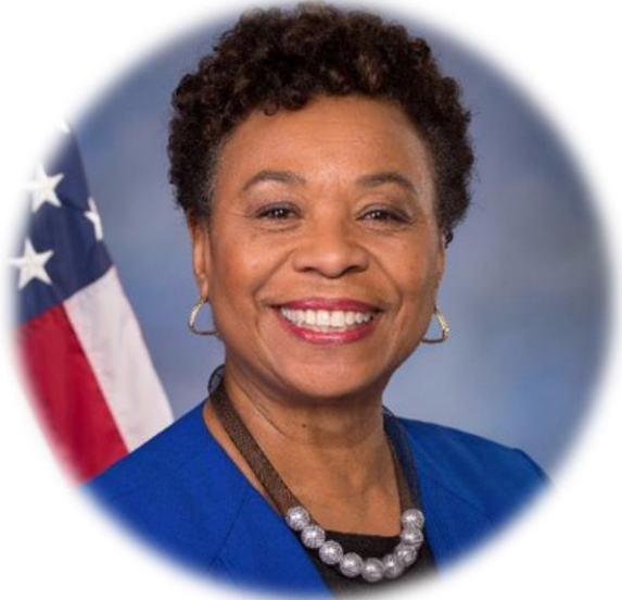
Honorable Barbara Lee Member, U.S. House of Representatives; Co-Chair, Congressional Black Caucus Diversity Task Force; Co-Chair, Congressional Asian Pacific American Caucus Health Care Task Force @RepBarbaraLee

In 1998, Congresswoman Barbara Lee was elected to serve California's 9th congressional district (now the 13th) in a special election. In 2001, Congresswoman Lee received national attention as the only Member of Congress to oppose the authorization for the use of military force (AUMF) in the wake of the horrific events on September 11th. The Congresswoman believed this AUMF would become a blank check for endless war. As of 2013, this authorization had been used more than 30 times to engage in military action without Congressional oversight. Congresswoman Lee is working to repeal this blank check and restore Congress's constitutional oversight to matters of war and peace. She was also an outspoken opponent of the Iraq War. Currently, Congresswoman Lee serves on the Budget Committee and the powerful Appropriations Committee, which oversees all federal government spending. She serves on three subcommittees (State and Foreign Operations; Labor, Health and Human Services, Education; and Military Construction and Veterans Affairs) of the Appropriations Committee. She currently serves as Co-Chair of the Pro-Choice Caucus. She is the former chair of the Congressional Black Caucus (111th Congress) and co-chair of the Congressional Progressive Caucus (109th & 110th Congresses).