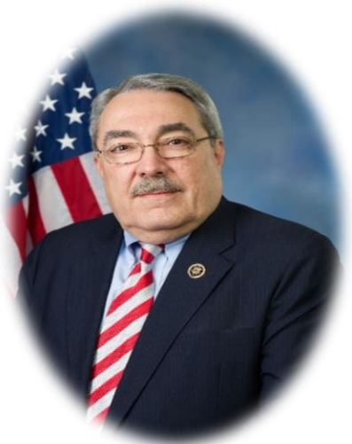
Honorable G. K. Butterfield Member U.S. House of Representatives @GKButterfield