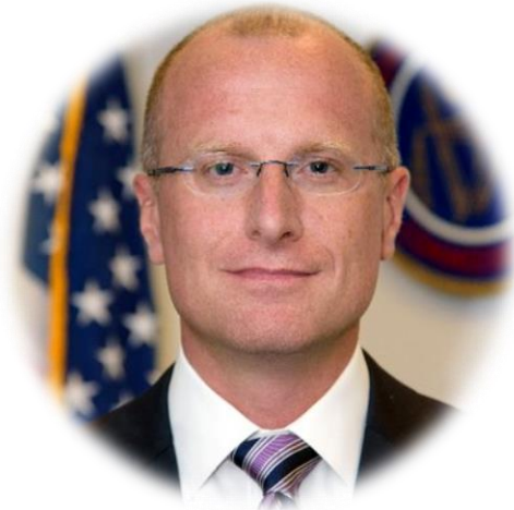
Honorable Brendan Carr Commissioner, Federal Communications Commission @BrendanCarrFCC @FCC #FCC

Brendan Carr was nominated to serve as a Commissioner of the FCC by President Donald J. Trump and was confirmed unanimously by the United States Senate on August 3, 2017. He was sworn into office on August 11, 2017. Commissioner Carr brings to the position over a dozen years of public and private sector experience in technology and communications law and policy. Most recently, Commissioner Carr served as the General Counsel of the FCC. In that role, he served as the chief legal advisor to the Commission and FCC staff on all matters within the agency's jurisdiction. Previously, he served as the lead advisor to FCC Commissioner Ajit Pai on wireless, public safety, and international issues. Before that, he worked as an attorney in the FCC's Office of General Counsel, where he provided legal advice on a wide range of spectrum policy, competition, and public safety matters.