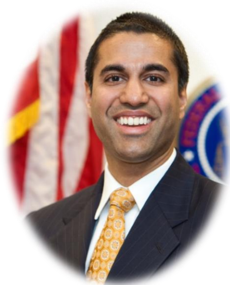
Honorable Ajit Pai Chairman, Federal Communications Commission @ AjitPaiFCC @FCC #FCC