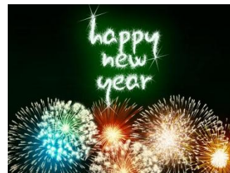
Happy New Year from the NACCC!

First Congregational Church of Wauwatosa, WI began a free concert series on December 18th.