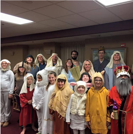
Plymouth Congregational Church of Wichita, KS hosted their annual intergenerational Christmas Pageant.

communication, of doing, of Dreaming*Talking*Acting together!