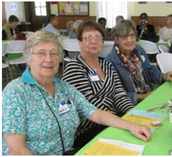
Ormond Beach Tomoka