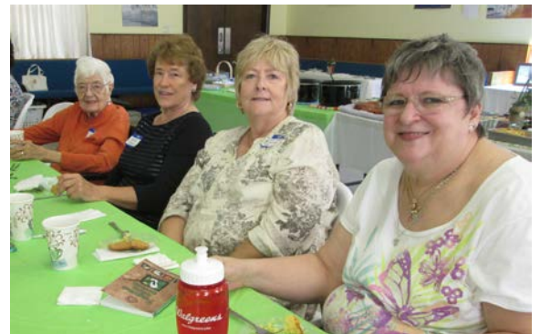
Ormond by the Sea Riverview